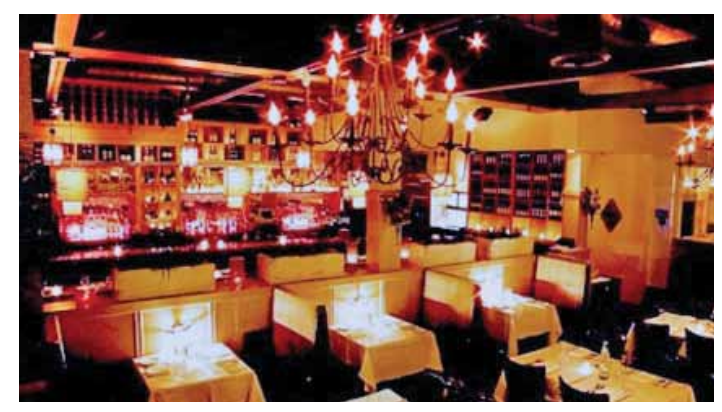
Brunch at Masa