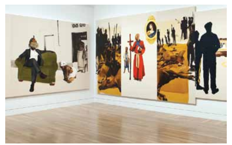
Example of Meleko Mokgosi's work - entitled "Bulletproof"

Botswana, the New York-based artist creates scenes that investigate Southern Africa's past and present. Meet at the ICA, 100 Northern Avenue. From South Station, take the Silver Line one stop to the Courthouse. Exit the station onto Seaport Boulevard and walk away from downtown. Just before the first traffic light, there will be a pedestrian opening in the fence on your left – walk through it to the walkway that runs alongside the Chapel of Our Lady of Good Voyage. This will lead you to Northern Avenue. The ICA is across the street to the right. BHV members & guests only. Free admission to the Museum. Lunch is pay individually.