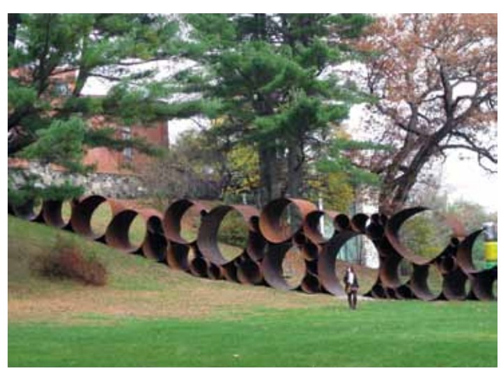
deCordova Museum Sculpture Garden