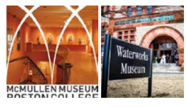
McMullen & Waterworks Museums Wednesday, April 13

for hosting the Seder and for the wonderful work that they do, please bring a check (made payable to the WLP) to the Seder. Meet at 67 Newbury Street. BHV members and their guests. Free. Registration required.