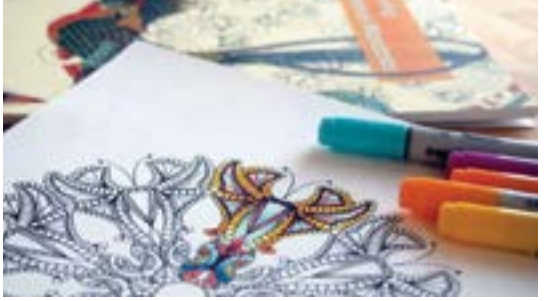
Coloring for Adults