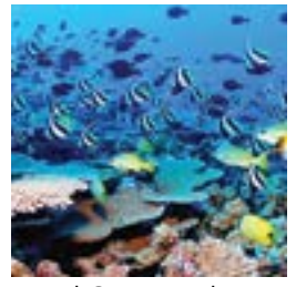
Travel Group: Belize