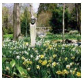
Blithewold Mansion & Gardens