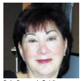
Role Reversal: Guiding Families as They Navigate Aging Life Transitions