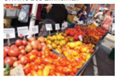
Davis Square Farmer's Market