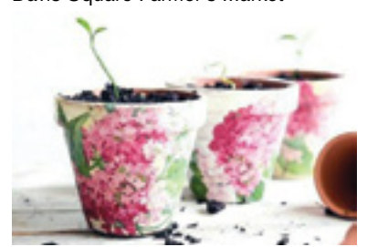
Decoupage with Janie