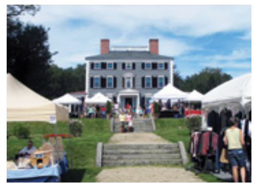
Codman Estate Fine Arts & Crafts Festival

Founder of the German Bauhaus design school and one of the most influential architects of the 20th century, Walter Gropius designed the Gropius House in Lincoln as his family