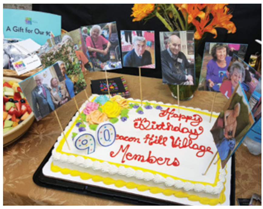
Beacon Hill Village honors its members who have reached the impressive milestone of 90+ years of living at its Annual All Member Birthday Party. Shown in photo are pictures of some of the honored guests.