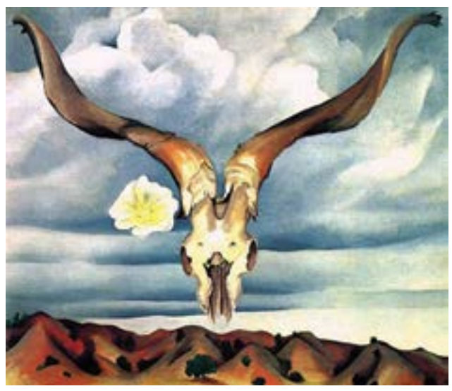
Peabody Essex Museum: Georgia O'Keeffe