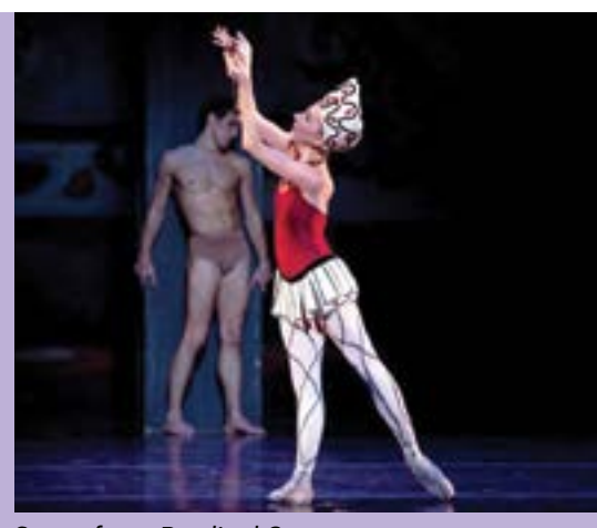
Scene from Prodigal Son