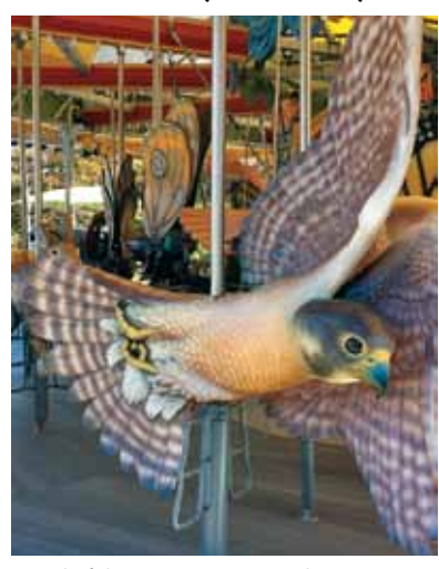
Detail of the Greenway carousel.

Walk the length of the Rose Kennedy Greenway from the North End to Chinatown – approximately 1.5 miles – with Joan Doucette. The Greenway is comprised of a series of parks filled with plants and trees, fountains, public art, a vegetable garden and, best of all, a carousel. After the walk, for those who wish, we'll have lunch at a restaurant in Chinatown.