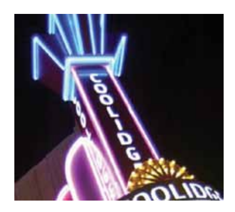
Movies at the Coolidge Wednesday, January 22