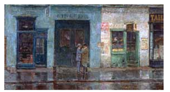
Addison Gallery of American Art (painting above: Childe Hassam, Little Cobbler's Shop, 1910)