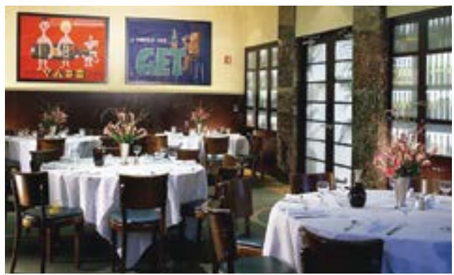
Lunch Group: Brasserie JO

diverse collection of plants under glass in the greater Boston area. Among the 15 interconnected greenhouses are the Desert House, showcasing cacti and succulents in a series of miniature landscapes, and the Tropic House, where palms, cycads and bananas grow. One of the prizes in the collection is the 130-plus year old Durant camellia from the college's founder. After visiting the greenhouses, we'll head over to the other side of campus for a tour of the Davis Museum. A light eat-on-the-go snack will be provided to tide you over until the return to Boston. Meet at Café Tatte, 70 Charles Street, at 9:30 a.m., or Starbucks, 165 Newbury Street (between Dartmouth & Exeter), at 9:35 a.m. BHV members: $30. Prospective members and guests of BHV members: $45. Price includes van transportation, admission to and tour of the greenhouses and a snack.