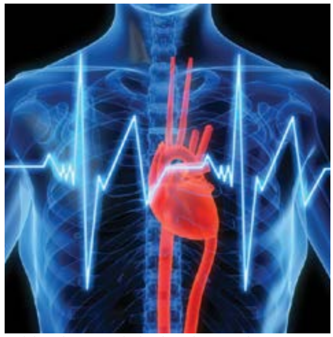
Cardiology: The Science Behind Strokes and Heart Attacks