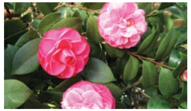
Lyman Estate: Mansion & Camellia Greenhouse Tour