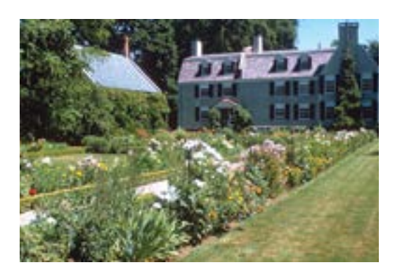
Adams National Historical Park