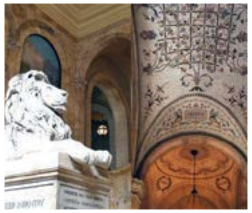
Boston Public Library Art & Architecture Tour

ture, intricate plaster work, elaborate art glass windows, and unexpected architectural flourishes all work together to create a cohesive masterpiece. To enter the Mansion, you'll need to climb eight stairs (with a railing). We've reserved spots for BHV on this public tour. Possibility of lunch afterwards. Meet at 395 Commonwealth Avenue (between Massachusetts Avenue and Charlesgate East) at 11:50 a.m. for our noon tour. Closest T station is Hynes Convention Center. BHV members and their guests and prospective members: $10.