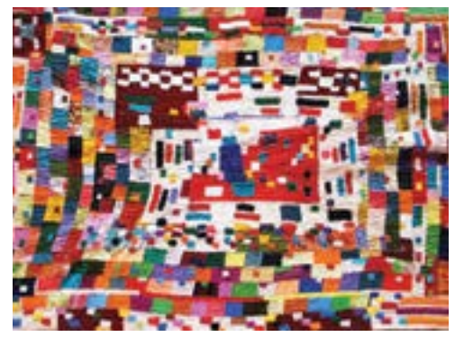
Davis Museum at Wellesley College